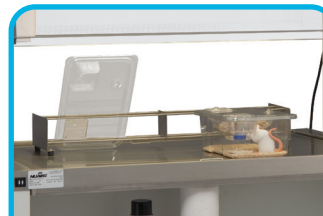
Cage Lid Holder