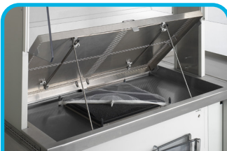
Removable Prop-Up Work Tray & Washable Mesh Pre-Filter