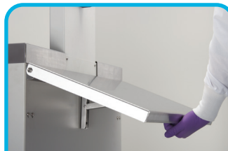
Stainless Steel Folding Shelf