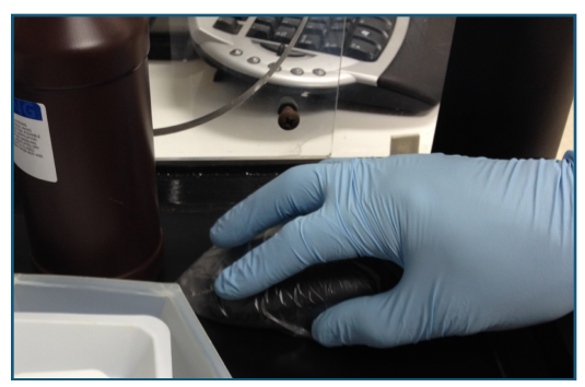
Reference-2: Wireless mouse inside the C-PEC with plastic protective cover

proceed to the next step. The solution is to place a wireless mouse inside the hood near the right sidewall. Most people are right-handed and so the computer monitor workstation that displays the software should be also set up on the right side of the C-PEC for best ergonomics. To avoid contaminating the mouse place sticky cellophane wrap (this is a dental supply product) over top of the mouse or bag the mouse in clear sandwich bag (See Reference-2 picture) . Now the technician can interact with the wireless mouse inside the hood without breaching