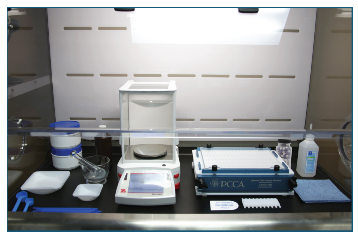
Reference-1: Proper Staging Inside the C-PEC

Staging all the chemicals inside the C-PEC is