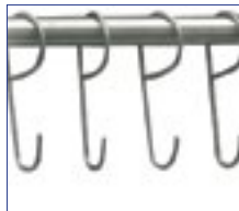
IV Bar - 3 Height Locations - 6 Hooks