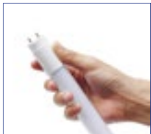
Exterior Ultra High Efficiency LED Lighting