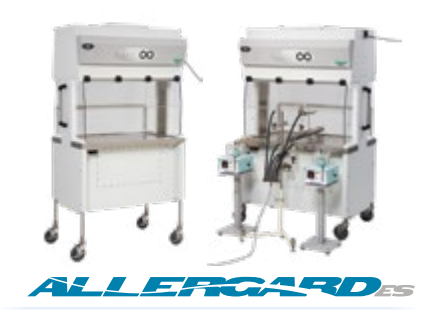
Animal Laboratory Products