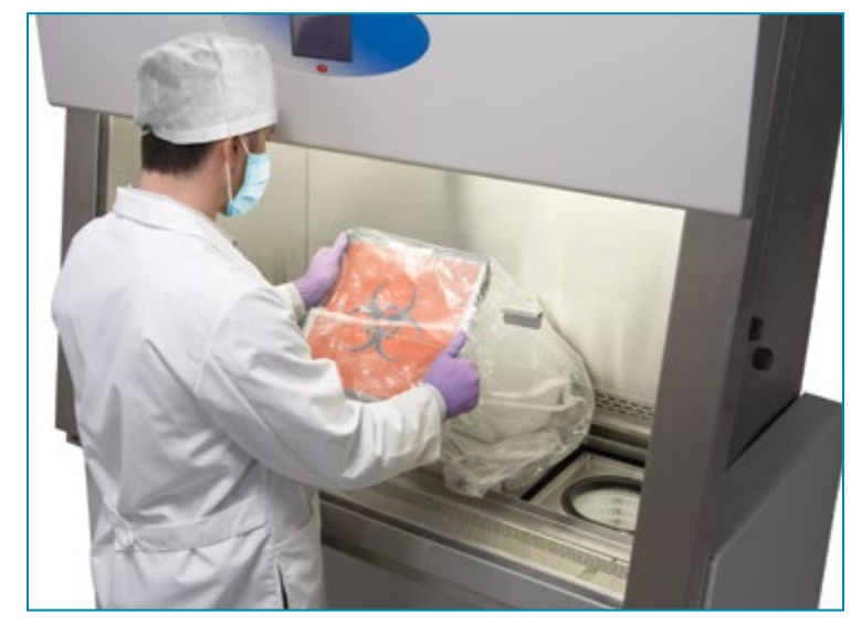
Note: Filter change process should be performed by a qualified service technician.