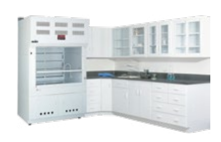
Polypropylene Fume Hoods and Casework