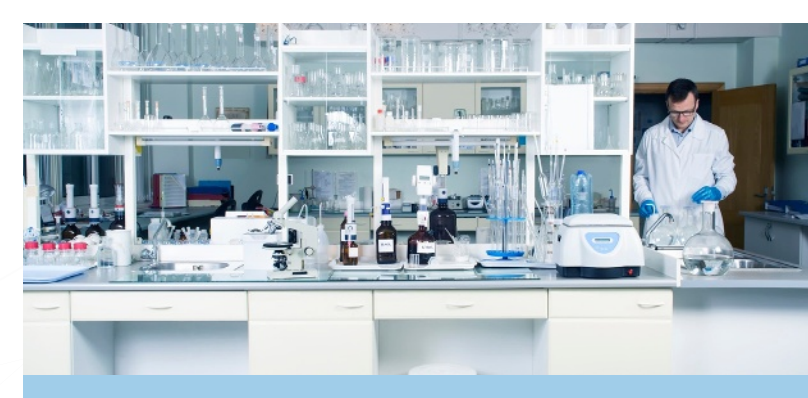
Image: Plan your work carefully so you can disinfect and place all the materials you need to conduct your experiment in the biosafety cabinet before you begin working.

Whether carrying out a chemical reaction within a fume hood or working with microorganisms contained by a biosafety cabinet, safe work practices should always be followed. We've reached out to the scientific community to bring you three top tips for working with each of these platforms.