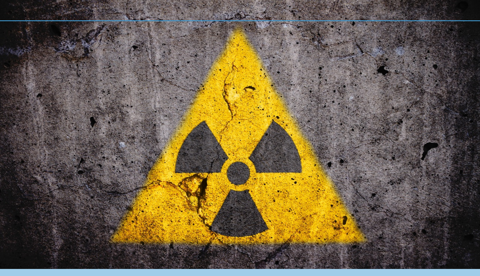
Image: Signs should be posted in visible areas listing what the hazards are, how they can be dealt with, and who can be contacted with questions.

RG1 refers to agents that are not associated with disease in healthy adults. Examples include E. coli, B. subtilis, and S. cerevisiae .