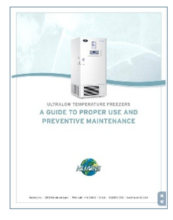
[White Paper] UltraLow Freezer: Proper Use and Preventive Maintenance