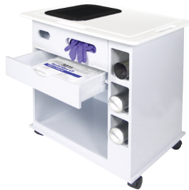
NU-96: Laboratory Cart