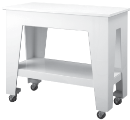
NU-98: Polypropylene Table